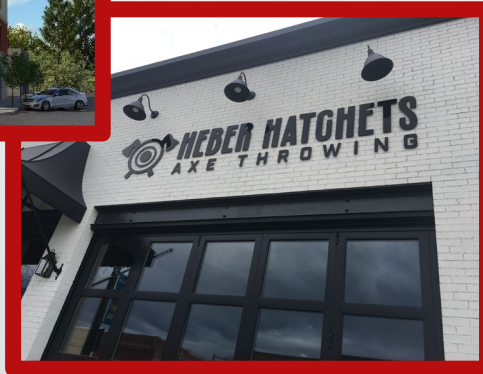
112 W. Kennewick Ave