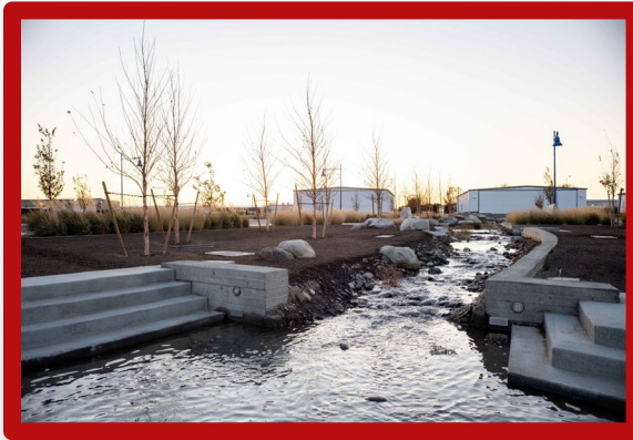
Vista Filed Waterway