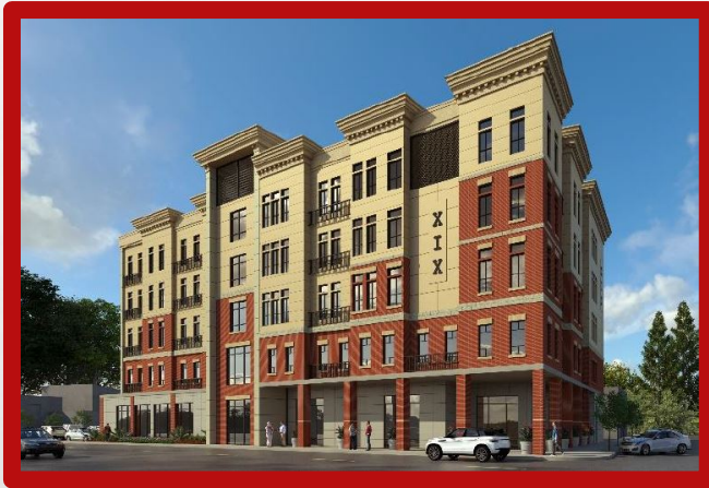
19 W. Canal Street